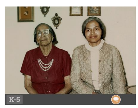
Rosa Parks: A Proud Daughter: Analyze a greeting card to learn about a family, who they are, and what feelings they were expressing.