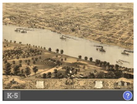
A Bird's Eye View: Wondering with Maps: Explore a map from long ago and begin wondering about the places where people

These episodes join six existing episodes where K-5 students work with primary source photographs to explore Civic Engagement and Congress :